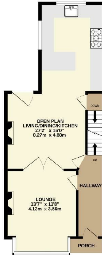
GROUND FLOOR 567 sq.ft. (52.7 sq.m.) approx.